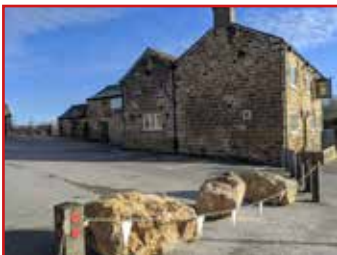
Pictured above is the Spread Eagle In Wragby.

Keep a look on our social media on Twitter and Facebook for other presentation dates.